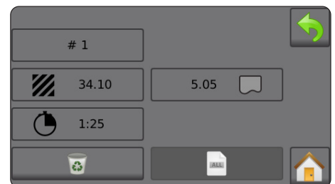
MATRIX® 430 v1.04