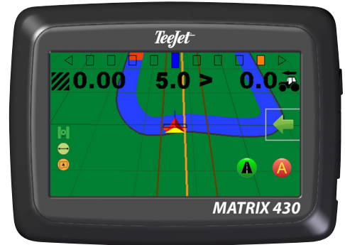
MATRIX® 430 v1.01