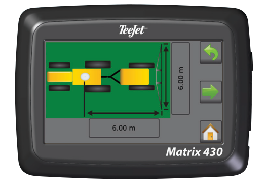
SYSTEM SETUP SCREEN