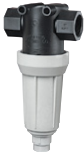
AA(B)126MLSC (Glass-filled Polypropylene)