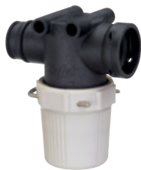
AA122ML-QC Compact Liquid Strainer