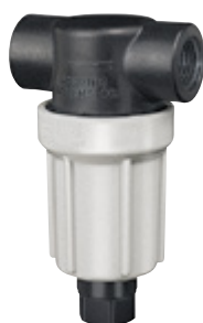
37270-122-PP Flush-Out Strainer