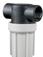
AA122-PP Compact Liquid Strainer