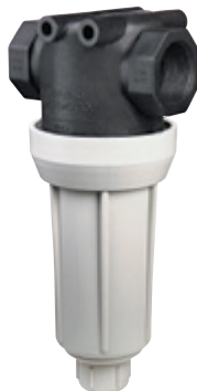
AA126ML-5 or -6