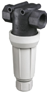
AA126ML-3 or -4