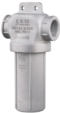
AA(B)124ML-AL (with mounting holes)