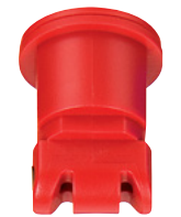
AITTJ60 SPRAY TIP

With air induction tips air is mixed with water through a venturi air aspirator that produces large air-filled droplets. When a PWM valve is used in conjunction with certain air induction tips, the mixing chamber and air inlet can fill with water as the PWM valve cycles. This can then result in water escaping out the air inlet holes, which can lead to poor distribution. New designs in air-induction tips however, have been proven to work well with PWM valves and nozzle control systems.